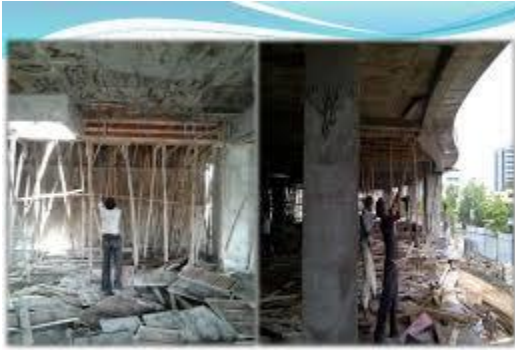
Fig-6.2.1 Removal of Formwork